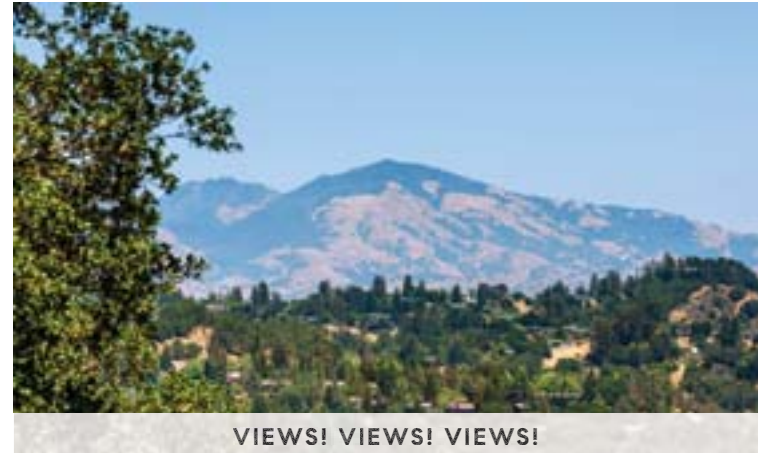
VIEWS! VIEWS! VIEWS!

5 Bed | 3.5 Bath | 3,326 Sq Ft | .76 Acres $2,295,000